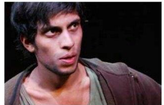
Original full frame image: Clutter in background Distracting